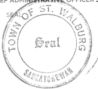
Chief Administrative Officer